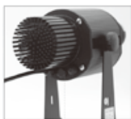
Rotate or Static Button

Turn the lens at the front of the projector in and out until the logo is clear and legible. Turn out (left) for closer distances and in (right) for further distance.