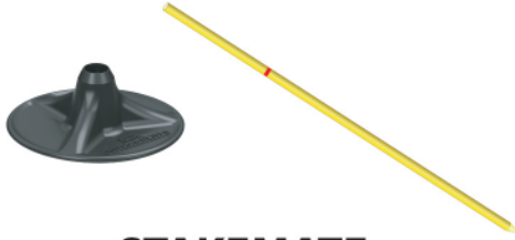
STAKEMATE GROUND PLATE

Assemble your chosen mounting option shown below using Step ③ to complete your Cluster Pole Kit.